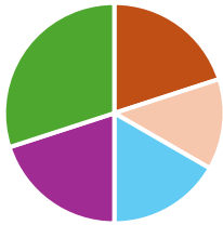
Areas of Action